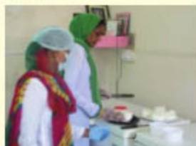
Making paneer with new equipment

Anmol Dugdh Samiti & Nirmal Dhara Dugdh Damiti in villages Amritpur Kalan & Taprana are stable and the women are working hard to grow their businesses. Both Collectives received modern dairy equipment provided by the Bajj Nath Bhandari Public Charitable Trust. The equipment facilitates making dairy products, e.g. khoya , yoghurt and paneer (cheese) in a hygienic and efficient manner. Both dairy collectives upgraded their premises, promoting better hygiene.