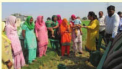
Visit to a demonstration farm in village Bastara

Plays Promote Awareness about Gram Sabhas: Arpana's SHG trainers worked with theatre resource group, Race Rangshala, to create 2 plays on Panchayati Raj which they presented before appreciative Panchayat members and large audiences in five villages. This created an awareness about the importance of the gram sabha before the next meeting.