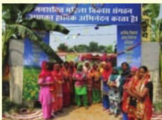
Women welcome guests to General Body Meeting

The general body meetings of the Federations were held in September in Taprana and Sangohi villages after meticulous planning by SHGs for 600-700 women participants in each general body meeting. CSSRI (Central Soil Salinity Research Institute) gave valuable information to women farmers on farming methods to alleviate damage caused by climate change.