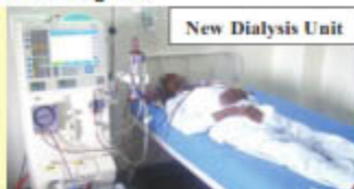
New Dialysis Unit