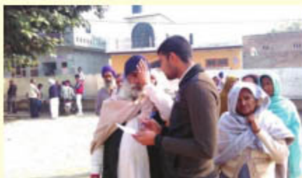
11,185 patients seen in village outreach camps

1. Budhakhera Clinic: 845 patients from villages.