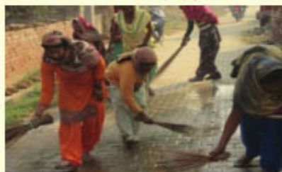
Village sanitation drive

192 street meetings and sanitation drives were held attended by 9,421 women from 697 groups. 7,350 women segregated garbage before disposal and 117 garbage pits were dug.