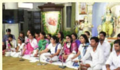
Young adults sing 'Urvashi' at Arpana's function

The Academy offers vocal and instrumental music, dance, yoga, painting, arts and crafts and dramatics.