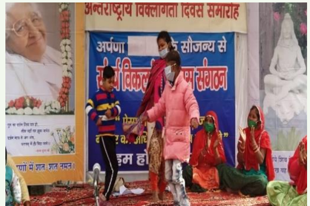
Differently abled children dance in celebration!