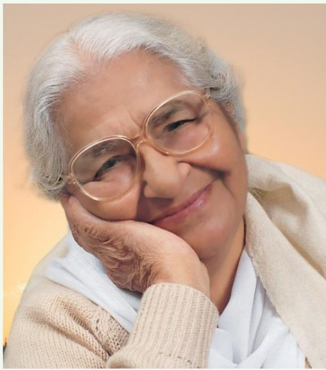
PARAM PUJYA MA