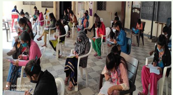
Senior classes return to school – with precautions!

From January to March 2021, class 9 to 12 students returned to Arpana Centre for classes. Students and teachers were back on track and the academic learning gained momentum.