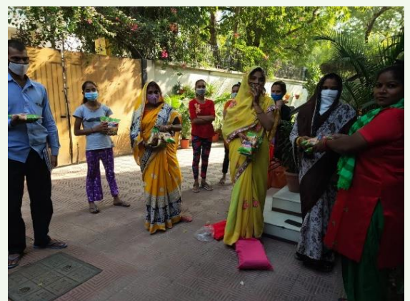
Rations distributed to students' families

The pandemic taught all of us the values of resilience and responsibility, and the importance of keeping our morale high with optimism, self-reflection, and gratitude. Our efforts have instilled a routine and discipline for the children as well as for ourselves, all of which has opened up new frontiers of learning and has proved vital for surviving these unprecedented times.