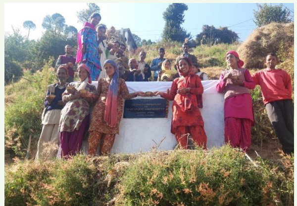
Irrigation Tank built in Bhankhanda hamlet

Arpana Guernsey, through a grant from Guernsey Overseas Aid Commission, supported 4 more water tanks and irrigation systems in another four remote hamlets – Dhanota, Bhankhanda, Chabri and Huded. SHG women and farmers participated actively and diligently in both the planning and the construction of the projects.