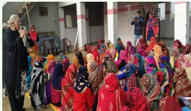
Women from all 8 self help groups of Sirsse learn about the evils of substance abuse

Alcoholics Anonymous held sessions with Arpana trainers, impressing them with the effectiveness of AA counselling. Women, whose menfolk are victims of alcoholism, were especially counselled about recovery and relief centers run by government and private agencies.