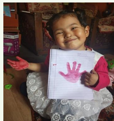
Hand Printing Assignment

Online Celebrations included Independence Day, Janmashtmi, Gandhi Jayanti, Children's Day, Diwali, Christmas and Republic Day. Students were excited as they participated in activities like making posters, songs and dances.