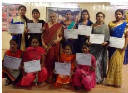
Nursery Teachers Certificates

Craft and Tailoring Classes: 26 trainees received Certificates for their year-long course.